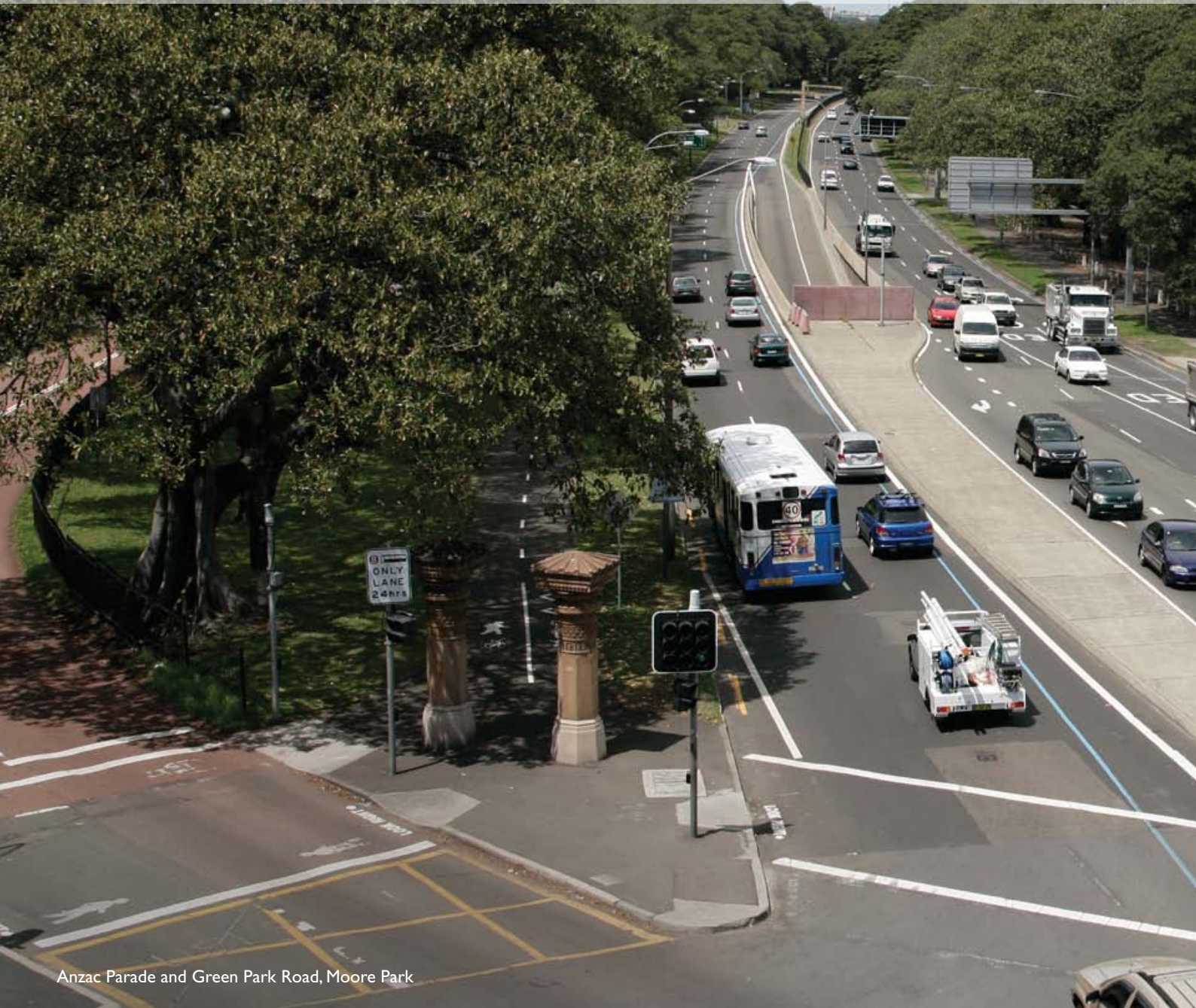
Anzac Parade and Green Park Road, Moore Park