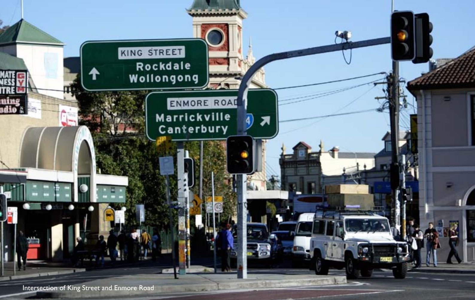
Intersection of King Street and Enmore Road

The RTA is committed to improving the road network by maximising efficiency and reducing congestion through investment and innovation; maintaining road infrastructure by improving the quality of road surfaces; and improving road safety by reducing fatalities and the number of road crashes. The SCATS system is a primary contributor to achieving this commitment.